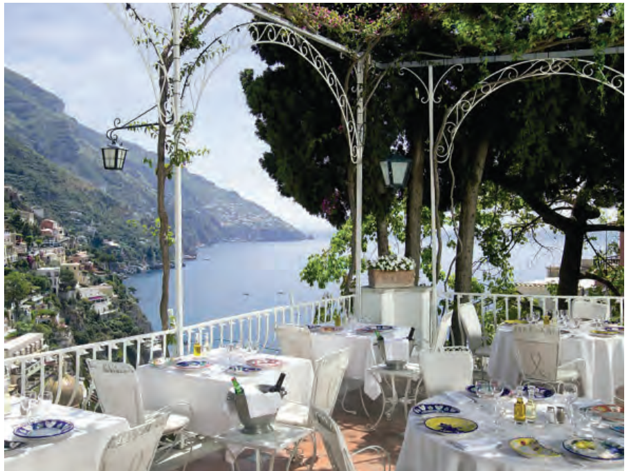
Restaurant at Hotel Poseidon

You have the next six days to explore Positano and the stunning Amalfi Coast. The picturesque town of Positano is like something out of a fairy tale. The colourful houses, all built into the steep rock, seem to be stacked on top of each other reaching up the cliff from the sea. When the seas are calm, small boats ferry visitors from Positano's port to the neighbouring town of Amalfi and to the islands of Procida, Capri and Ischia. From your base in Positano it is also possible to travel up further into the mountains to Ravello, and drop down the other side to explore the sights of Sorrento, Pompeii and Herculaneum.